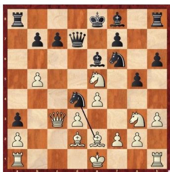
Why shouldn't Black take the bishop on e2? What happens?