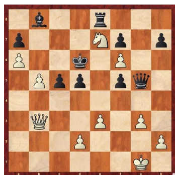
White moves and mates

P.S. If your dog eats your newsletter at this point don't worry 😊