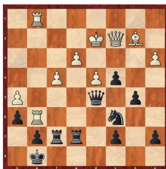
Find the winning idea for Black. Hint: Knights have horsepower

REMEMBER FIDO SAYS THERE'S AWARDS FOR SIMPLY HAVING A GO